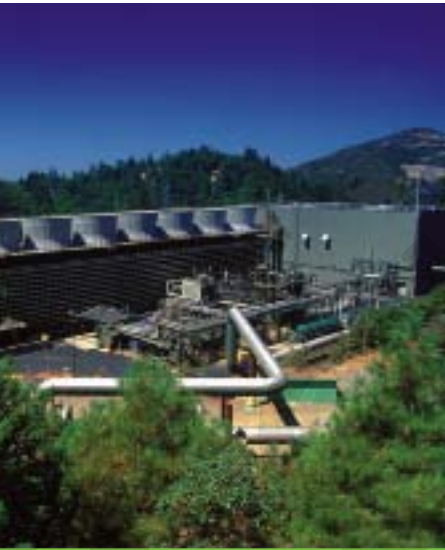
Geothermal energy plant at The Geysers near Santa Rosa in Northern California, the world’s largest electricity-generating geothermal development.

To accelerate the discovery and utilization of the U.S. Geological Survey’s estimated 30,000 MWe of undiscovered hydrothermal resources in the western United States, GTP is developing advanced geothermal exploration technologies. Improving our ability to accurately predict temperature and permeability at depth from the surface can substantially lower resource confirmation risks and reduce upfront geothermal development costs. Locating undiscovered geothermal resources will support the near-term expansion of renewable energy because once found, hydrothermal resources can be brought online quickly using current